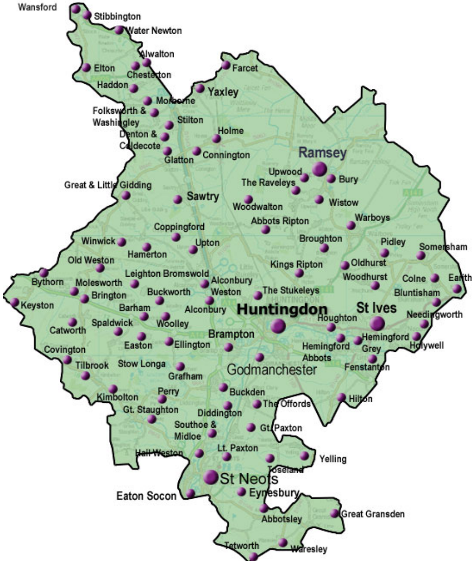
Based on the Ordnance Survey Mapping.